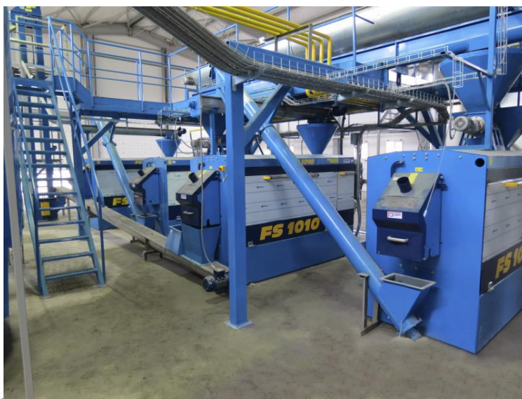
Fig. 5 PS2 – Pressing shop

The scheme in the Enclosure no.1 does not provide particular technological equipment of the pressing plant. This will be drawn after choosing suitable pressing technology. We are pleased to send you detailed information for the chosen type of the technology together with the detailed technological scheme PS2 – Pressing Plant.