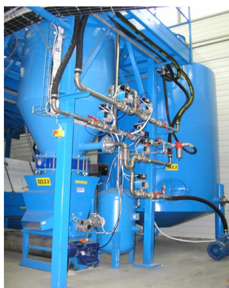
Fig. 7 PS3 – Automatic filtration