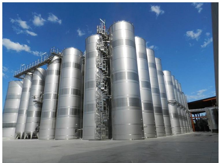
Fig. 9 PS4 – Oil storage

We have a lot of negative experience with customer’s underestimating demands on good quality storing of vegetable oils. It is necessary to solve