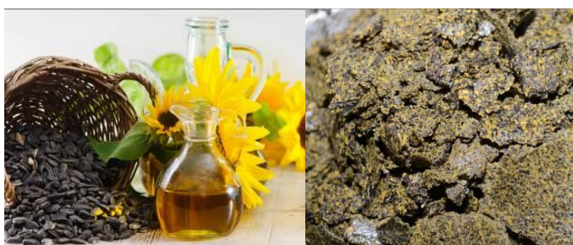
Fig. 3 - Oilseeds, oil, pressing cakes

We basically understand the pressing process as the only separation of oil from oilseeds.