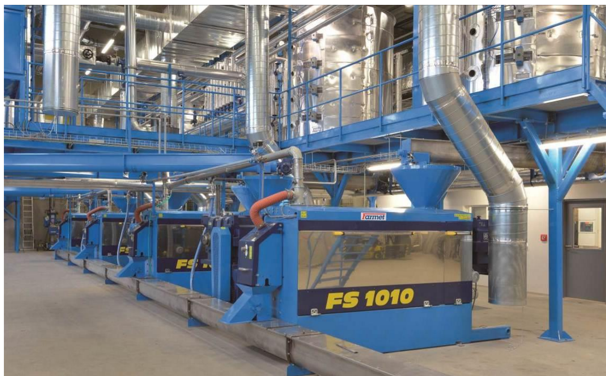
Fig. 2 – Pressing shop for vegetable oils

This material is intended for clarification of basic requirements and attitudes leading to the realization of the entire plant for extrusion of vegetable oils. It deals with the solution of the technological part of the plant and with requirements for the solution of the construction part. It does not deal with designing or realization of the construction part, energy sources or media. Standards of Farmet Corporation for the technological device delivery have been stated there.