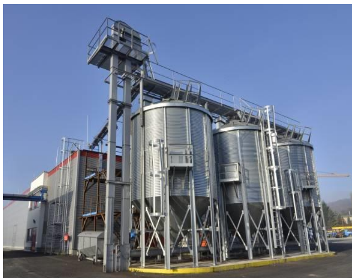
Fig. 4 PS1 – Input and storing of seeds

For clarity the complete technological process is described in detail and divided into a few operational sets “PS” , which are closely described below and showed at the technological scheme - See the Enclosure no.1. The operational set PS is a set of machines and devices individually ensuring carrying out given technological operations.