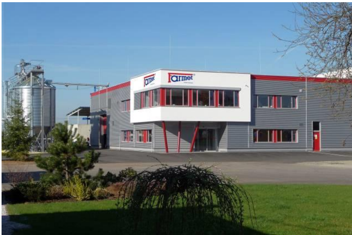
Fig. 1 – Specialized research and development centre Farmet a.s. in Ceska Skalice