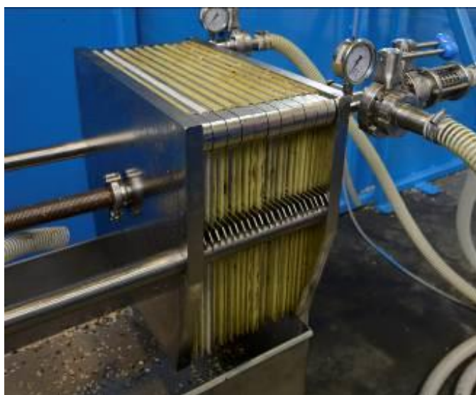
Fig. 6 PS3 - Desk filtration

When choosing suitable capacity of filtration it is necessary to result from the volume of oil production (depending on the type of oilseeds and its oiliness). In most cases the capacity of filtration is being purchased with extra back-up performance for possible enlarging the pressing capacities.