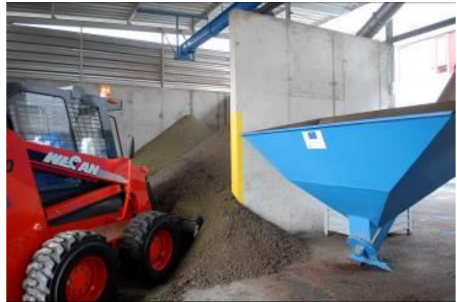
Fig. 8 PS4 – Cakes storage

This operational set needs to be solved after having particular knowledge about disposition of the building and investor’s requirements. The size of the storage depends mainly on the investor’s wish; what is his required storing amount to make sufficient supply for his business activities or further technologies.