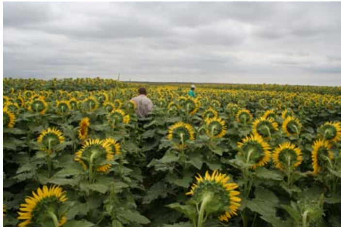
Figure 2. Nebraska producers are proving the potential for double-cropping sunflower after wheat.

An advantage of sunflower and canola production over other alternative oilseeds is that production practices and co-product markets are common outside of Nebraska and could be adopted from near-by regions. Due to the higher oil content, mechanical processing facilities may be feasible at the local level rather than transporting oilseeds long distances to large scale solvent extraction facilities. More importantly, sunflower and canola can produce oil that is highly desirable for human consumption. In efforts to produce healthier foods, the food industry is committed to eliminating trans fats and lowering saturated fat levels. With that in mind, oilseed processors may have the opportunity to market the oil into premium food grade markets. If the premium markets are fully supplied, a strong market will likely still exist for the commodity based biodiesel feedstock market.