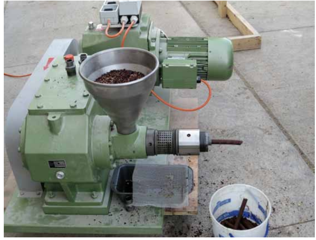
Solid shaft machines are easy to operate and can also be operated in a portable manner that brings the machine to the seeds

community-based facility is the opportunity for local ownership and investment. The one who owns the plant is the one that ultimately benefits the most. In the case of local ownership, the community model would ideally include ownership by local feedstock growers, animal feed consumers, fuel consumers and others who can benefit from being owners in the business and be directly involved.